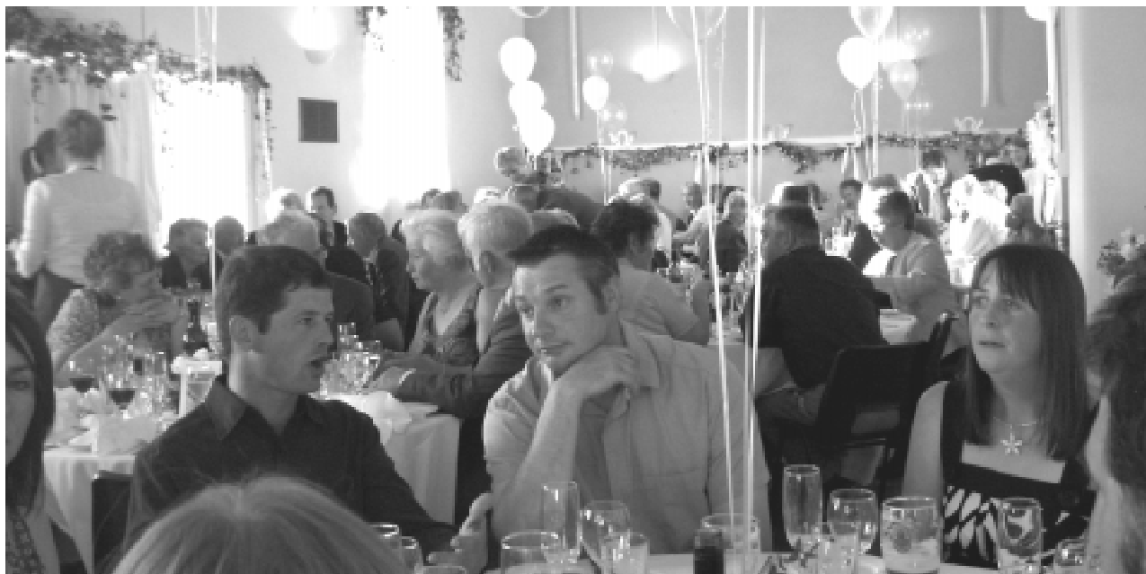
Enjoying the evening celebrations