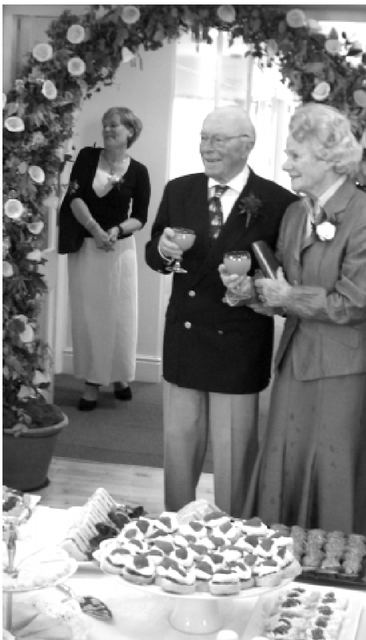
The happy couple

From donations received in lieu of presents, Clapham children's playground received £800 and St. John's Hospice, Lancaster received £1000.