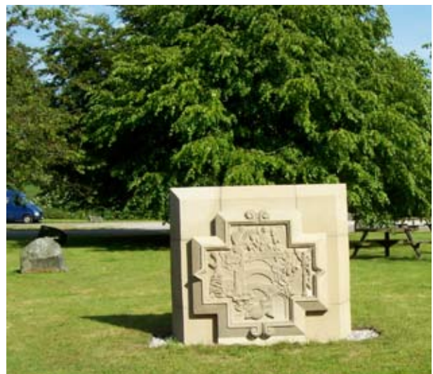
The Millennium Stone in its new, sunnier position.