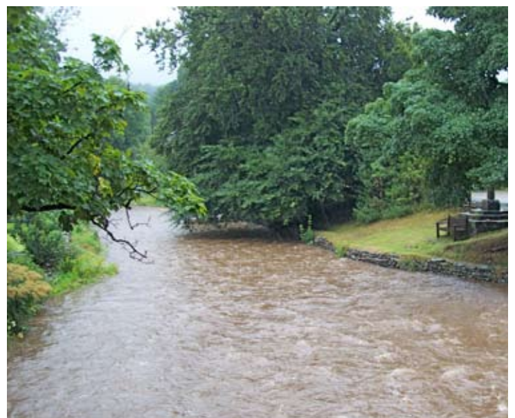
What a difference a day makes – Street Fair Day on the left and on the right the same location 24 hours later!